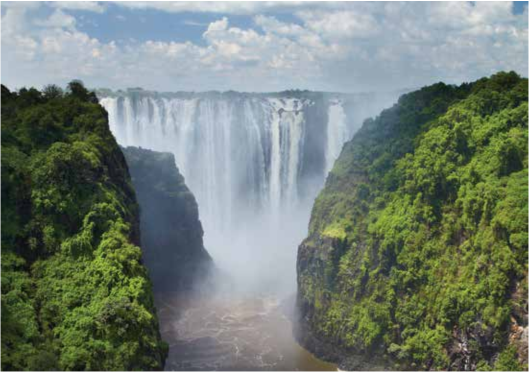
Known as the “Smoke that Thunders,” Victoria Falls is one of the wonders of the natural world.

embark on a game-viewing boat safari on the Chobe River, where we may see hippo, crocs, and some of the park’s 450 species of birds (including the sacred ibis, carmine bee-eaters, fish eagles, and kingfishers). We dine tonight at our lodge. B,L,D