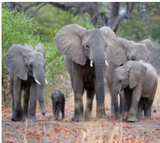
Elephants abound at Chobe

antelope, and other animals, which we can watch from lodge’s open deck. Tonight, we celebrate our wildlife adventure at a farewell dinner. B,L,D