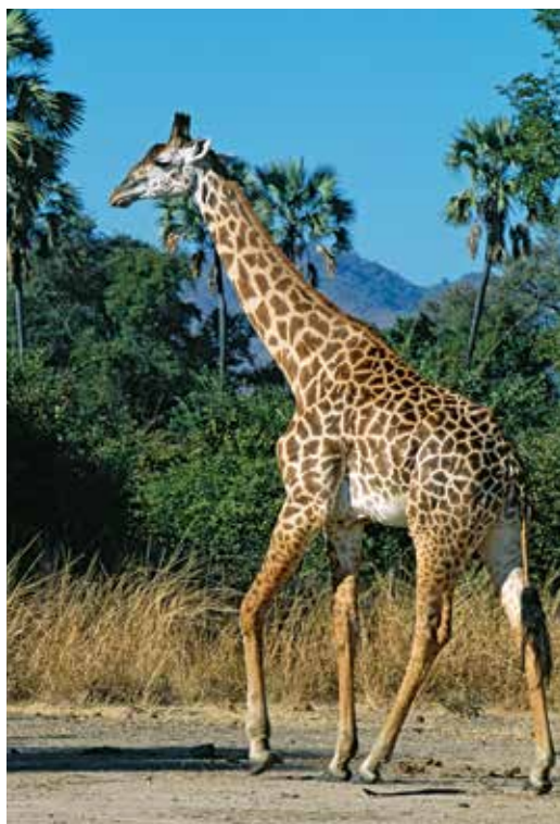
South Luangwa giraffe

Day 12: South Luangwa National Park We have another day to savor life in the bush and engage in morning and evening game viewing activities. Set amidst a grove of ebony and mahogany trees, our 18-chalet lodge overlooks two lagoons that attract a steady stream of crocodiles, hippos, giraffe, buffalo,