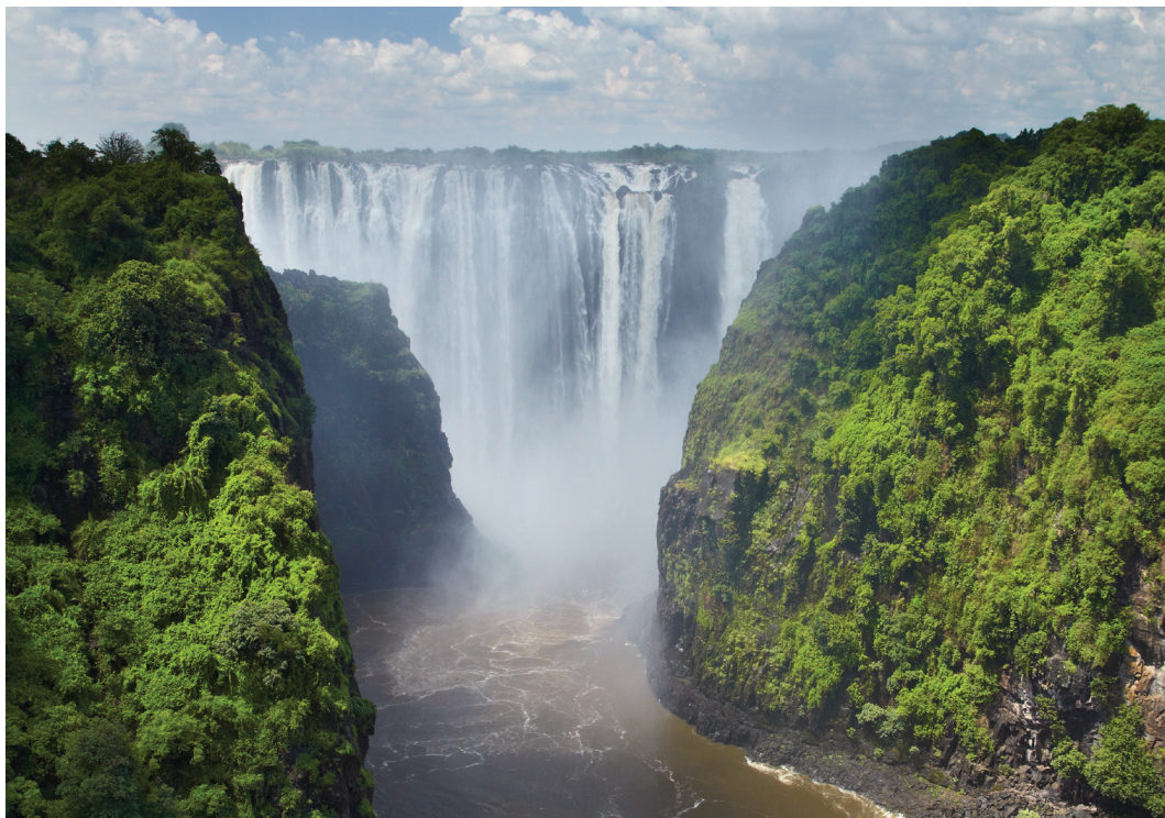
Known as the “Smoke that Thunders,” Victoria Falls is one of the wonders of the natural world.

embark on a game-viewing boat safari on the Chobe River, where we may see hippo, crocs, and some of the park’s 450 species of birds (including the sacred ibis, carmine bee-eaters, fish eagles, and kingfishers). We dine tonight at our lodge. B,L,D