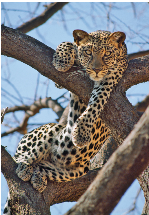
Getting comfortable ...