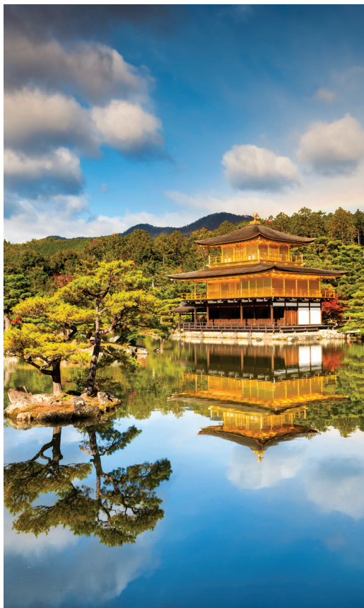
We visit Kyoto’s Temple of the Golden Pavilion on Day 10.