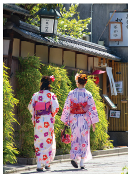
Geishas in traditional dress

Day 11: Kyoto More of Kyoto is on tap today, beginning with a visit to the otherworldly Arashiyama Bamboo Grove; the Kyoto Museum of Traditional Crafts (Fureaikan), showcasing all of Kyoto’s 74 different métiers in one place; and Nijo-jo Castle (c. 1603), the extravagant residence and fortifications of the shoguns who ruled Japan for more than 250 years. Then the remainder of the day is free for independent exploration in this traditional yet modern city before we gather for dinner together tonight. B,D