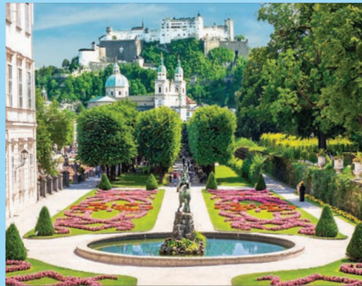
Stroll through the Baroque pleasure gardens of Mirabell Palace in the heart of Salzburg.

After lunch on board the ship, visit the UNESCO World Heritage-designated