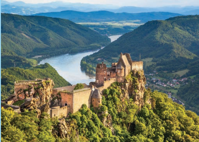
Cruise along the Danube River through the stunning natural beauty of the Wachau Valley landscape, a UNESCO World Heritage site.