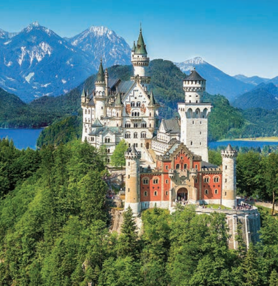
Admire enchanting Neuschwanstein Castle, built by King Ludwig II of Bavaria in 1886.