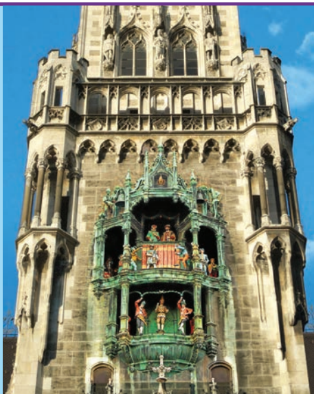
Delight in the reenactments of two scenes from Munich's history in the Glockenspiel on the city's town square, Marienplatz.

After breakfast, continue on the Historic Bavaria Post-Program Option or transfer to the airport for your return flight to the U.S.